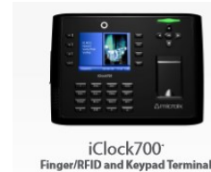
iClock700 ® Finger/RFID and Keypad Terminal