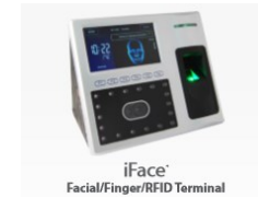
iFace ® Facial/Finger/RFID Terminal

Time Clock Quick Guide (Also, refer to Microix User Manual)