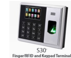
S30 ® Finger/RFID and Keypad Terminal