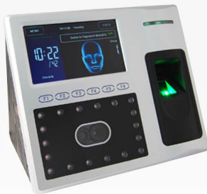
iFace ® Facial/Finger/RFID Terminal

Biometric combination terminal revolutionizing time tracking. Biometrically provides one second employee recognition even in dimly lit environment.