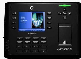
iClock700 ® Finger/RFID and Keypad Terminal

Biometric combination terminal revolutionizing time tracking. Biometrically provides one second employee recognition even in dimly lit environment.